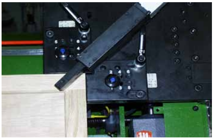
Manually Adjusted Stile and Rail Clamp Pads