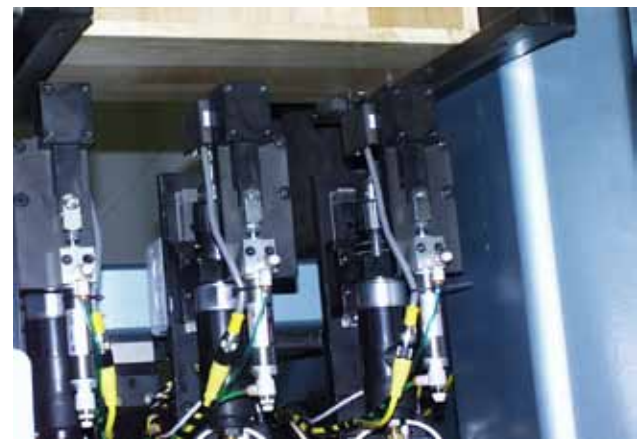
Drawer front multi-position center and corner drilling.