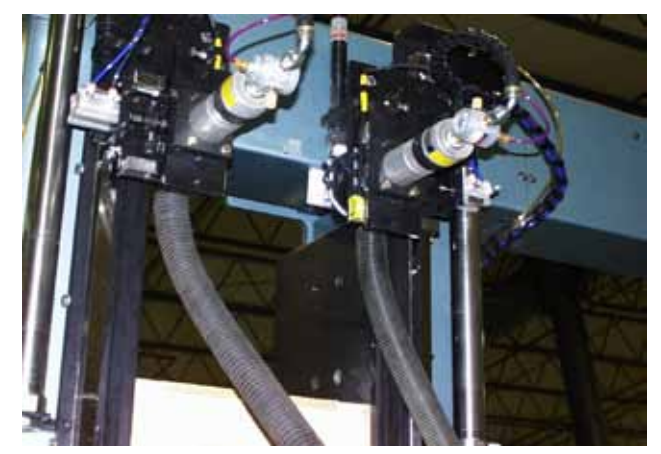
Rear view of the machine showing under mount drawer slide notch routers

The Premier Dovetail Drawer Machine is designed to assemble drawer boxes that use dovetail, box or doweled style corner joints. The boxes need to be loosely preassembled before clamping in this machine to ensure proper joint engagement. This machine is capable of producing 800 to 1,200 drawers per eight hour shift depending on the options selected. Standard joystick operation allows for quick and accurate size adjustments. Clamping is performed by an air motor, gear box and ball screw configuration providing the clamping force needed for a single cycle sequence. Front predrills and undermount glide clearance routers can be added as options. The frame is ergonomically designed at an angle for easy placement of sub-assembled drawers and fast removal of the finished product. Operating controls are simple and convenient to minimize training time. Machine functions are air powered with programmable electrical controls for accurate and reliable operation.