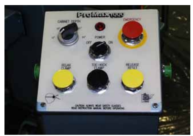
Operator Control Panel