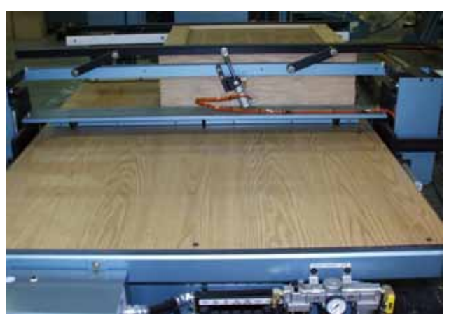
Side View of Down Clamp Assembly

The ProMax Cabinet Case Clamp is designed to clamp and hold common cabinet assemblies for manual fastening. This machine will accommodate most wall, vanity and base cabinets. Side and face frame clamping enable the operator a hands free fixture for manual fastening while insuring proper engagement and squareness of the components. Operating controls are simple and convenient to minimize training time. Machine functions are air powered with programmable electrical controls for accurate and reliable operation.