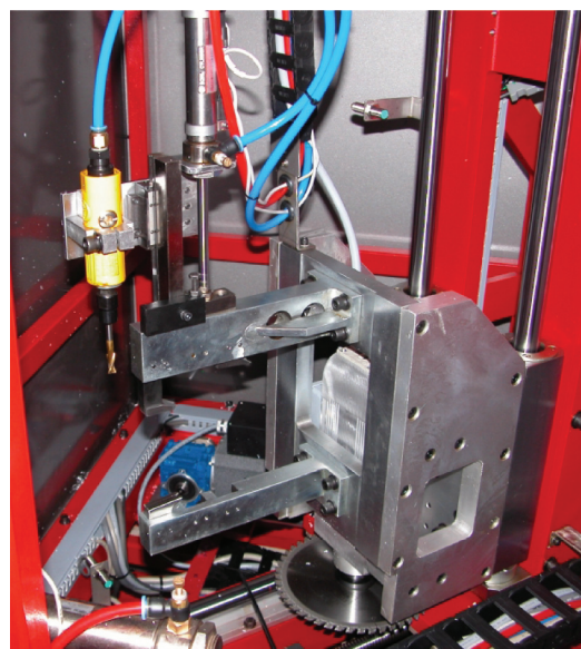
Close-up photo of servo-controlled cleaning tooling, including disc blade, scarf knives and vertical drill