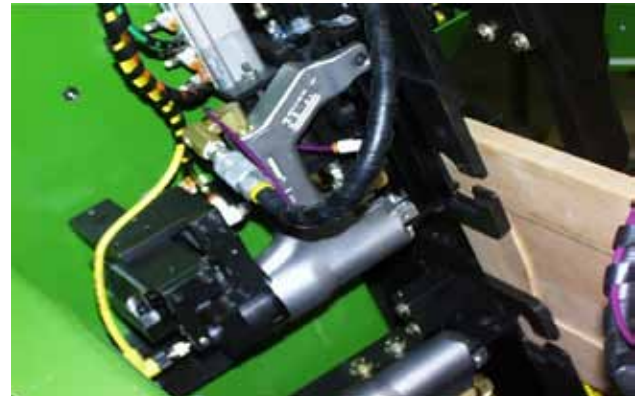
Undermount Tool Shift Assembly