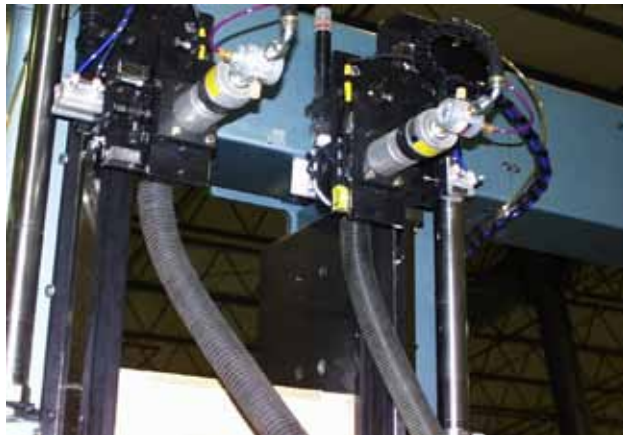
Rear view of the machine showing under mount drawer slide notch routers

The Premier Dovetail Drawer Machine is designed to assemble drawer boxes that use dovetail, box or doweled style corner joints. The boxes need to be loosely preassembled before clamping in this machine to ensure proper joint engagement. This machine is capable of producing 800 to 1,200 drawers per eight hour shift depending on the options selected. Standard joystick operation allows for quick and accurate size adjustments. Clamping is performed by an air motor, gear box and ball screw configuration providing the clamping force needed for a single cycle sequence. Front predrills and undermount glide clearance routers can be added as options. The frame is ergonomically designed at an angle for easy placement of sub-assembled drawers and fast removal of the finished product. Operating controls are simple and convenient to minimize training time. Machine functions are air powered with programmable electrical controls for accurate and reliable operation.