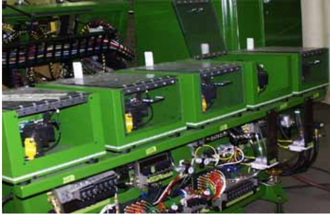
Bowl feeder assemblies