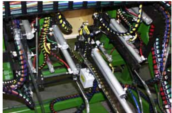
Drawer front screwdriver assemblies