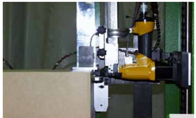
Drawer Back Fastening