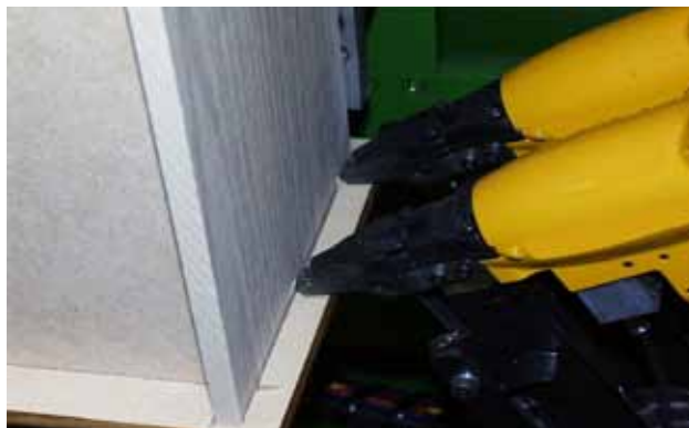
Drawer Front Fastening

The Premier Universal Drawer Machine is built for assembly line or work cell production. This machine squares, clamps and fastens a broad range of drawer sizes and styles. Once set, the machine builds mixed sizes in a single production run with simple mechanical adjustments by the operator. The machine automatically senses drawer length and height as it moves to square and clamp the parts in position and place fasteners. The completed drawer is automatically released. Clamping pressure is adjustable as needed to insure a tight joint during fastening.