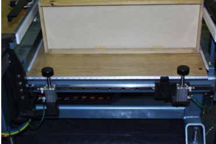
Toe Board Support Assembly