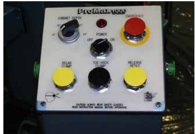
Operator Control Panel