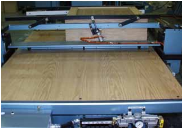
Side View of Down Clamp Assembly

The ProMax Cabinet Case Clamp is designed to clamp and hold common cabinet assemblies for manual fastening. This machine will accommodate most wall, vanity and base cabinets. Side and face frame clamping enable the operator a hands free fixture for manual fastening while insuring proper engagement and squareness of the components. Operating controls are simple and convenient to minimize training time. Machine functions are air powered with programmable electrical controls for accurate and reliable operation.