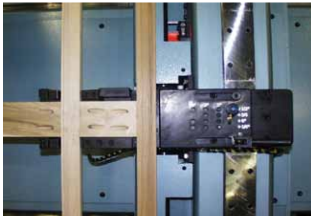
Horizontal mullion clamp assemblies for 1-1/2" mullions, vertical mullion clamp assembly for 3" mullion. Mullion clamp assemblies for other sizes produced upon request.

The ProMax Face Frame Assembly Machine is an affordable system that squares and clamps common sizes of base and wall cabinet face frame material allowing manual fastening procedures. Production rates of 300 to 400 frames per eight hour shift are possible depending upon the frame configuration. Standard joy stick operation allows quick and accurate size adjustments. Down clamps are included to insure flush joints prior to fastening. The frame is ergonomically designed at an angle for easy placement of sub-assembled frame parts and fast removal of the finished product. Operating controls are simple and convenient to minimize training time. Machine functions are air powered with programmable electrical controls for accurate and reliable operation.